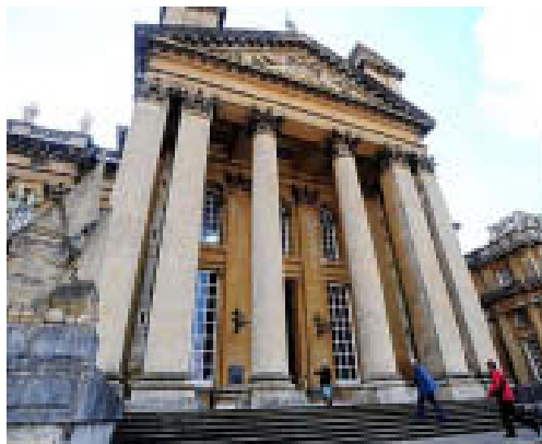
Scary thought: Blenheim Palace has Halloween fun