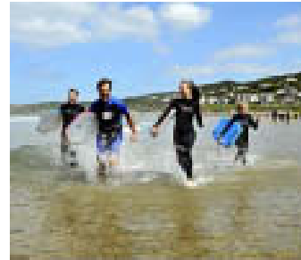
Wet and wild: Woolacombe

Visit Blenheim Palace in Oxfordshire this Halloween half-term (October 24-November 1) for some spooky goings-on, with a ghost trail, face-painting, pumpkin carving and family tours of the Palace's State Rooms - where you can meet the ghosts of the Palace's intriguing past. More details: www.blenheimpalace.com